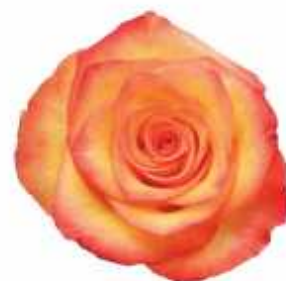
High & Magic