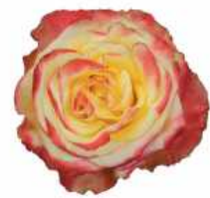
High & Yellow Flame