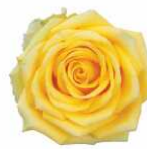
High & Exotic