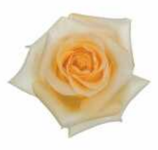
Crème de la Crème