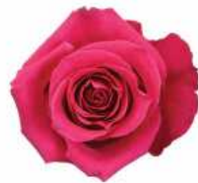
High & Mora