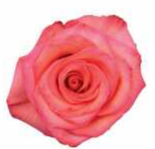
High & Orange