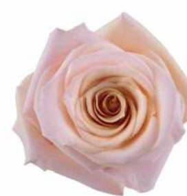
Mother of Pearl