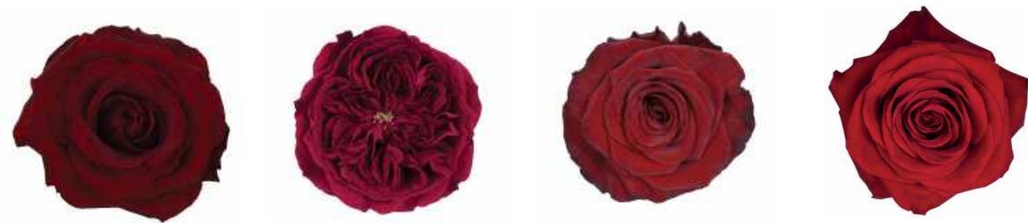
RP Black Pearl